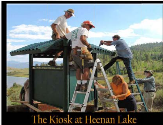
The Kiosk at Heenan Lake

The point is, winter can still offer us great fly fishing. All we have to do is get out there and then deal with whatever Mother Nature gives us.